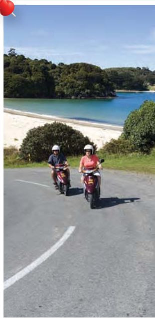
(Child 5-14 yrs)